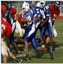
Head Coach Back On The Field In Lakewood