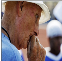
from NJ.com Staff