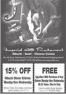
Published on 9/3/2010